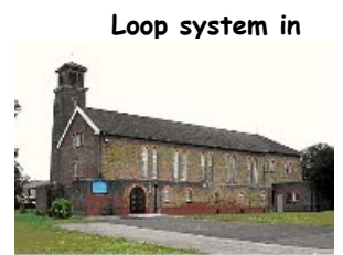
Loop system in