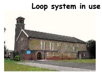
Loop system in use